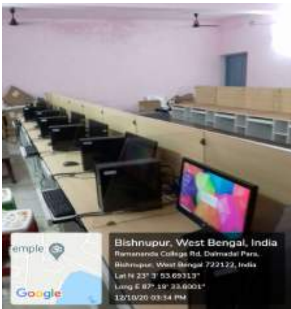
Picture of ICT of Computing Skill Lab